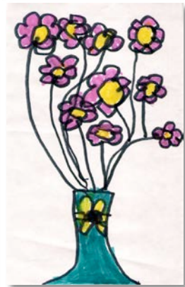
A drawing by McKell