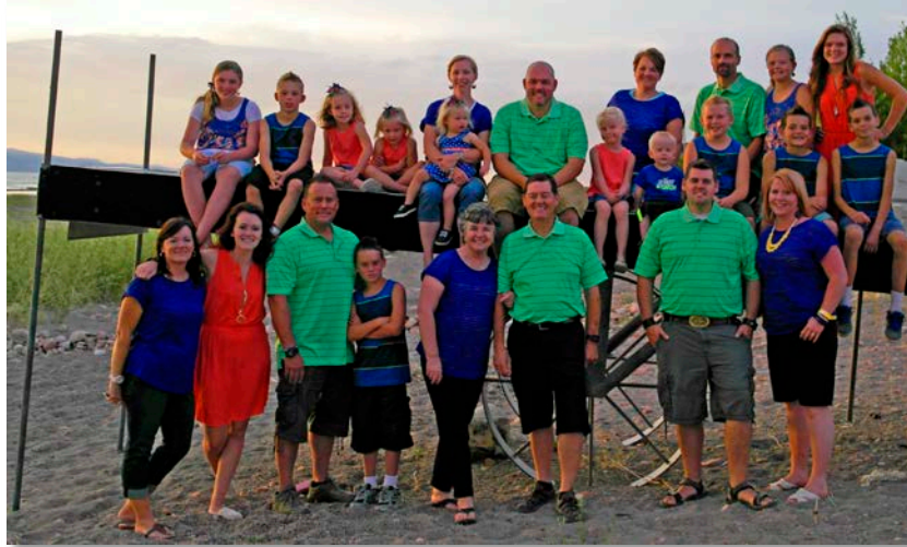
At Bear Lake 2014