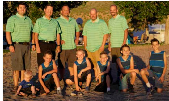
The “Men” of the Family