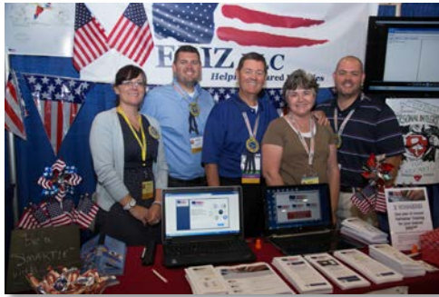
Our Business Booth – D.C., 2014