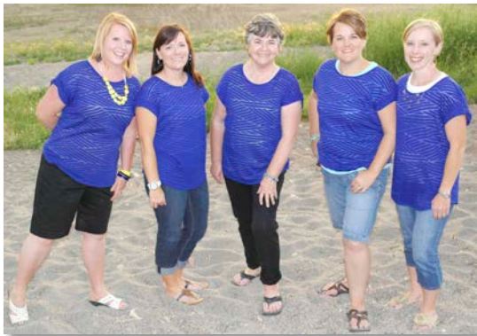
The Ladies of the Family