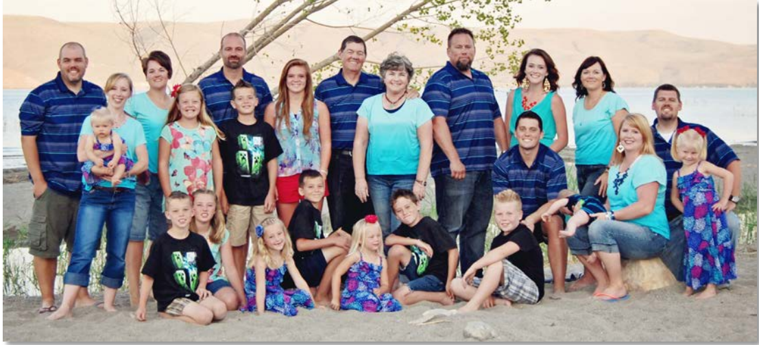
At Bear Lake 2013