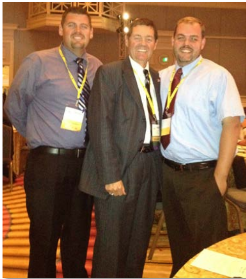
The Boys at NCMS – Chicago, 2013